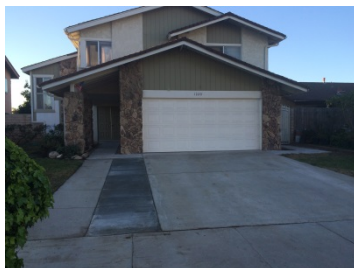
1220 Lindsay Place, Oxnard

Through the help of few investors this year, it made it possible for the PhilCenter to pay off the $200K remaining mortgage of the PhilCenter House at 1220 Lindsay Place in College Estates, Oxnard. Currently the house is appraised at $495K. The house title is now being processed in escrow in the name of the Philippine Center of Ventura County.