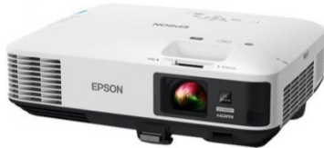
EPSON PowerLite 1975w 3LCD WXGA Video Projector

PhilCenter is now a proud owner of a much brighter projector capable of portraying clearer images on screen with 5,000 lumens power.